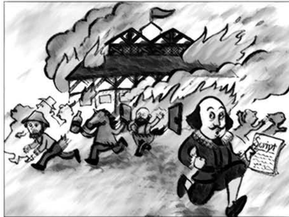
Shakespeare in Detroit

time there have been no events cancelled.