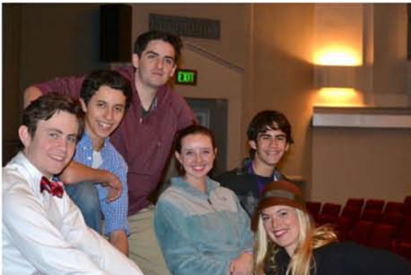
Some of the students who will benefit from rigging safety training

The program began in 2011 with a grant from JR Clancy and with support from ETC, Shepherd Exposition Services and H&H Specialties. Since then it has helped 65 schools in 22 states. Selections are made twice a year, once in the spring and once in the fall, and each round has resulted in at least 10 schools being approved for funding. Schools are approved based on perceived need and available funding.